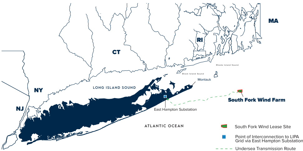
Figure 1: South Fork Wind Interconnection Map

South Fork Wind is a 12-turbine, 132 megawatt (MW) offshore wind farm powering 70,000 homes across Long Island, New York. Located 35 miles east of Montauk Point, the wind farm delivers power to the local substation in the Town of East Hampton through a series of transmission cable systems buried in the sea floor.