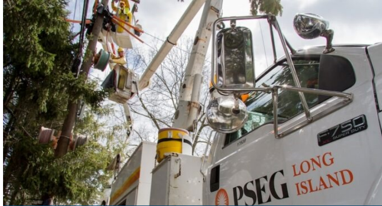
PSEG Long Island Reliability Upgrades