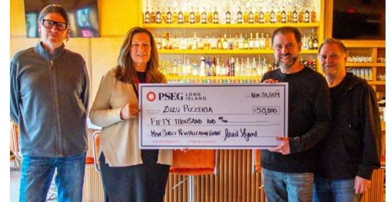
Promoting Incentives for Small Business Week on Long Island