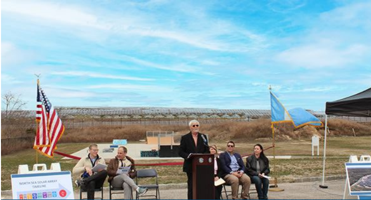
Southampton Town Community Solar Project Unveiling