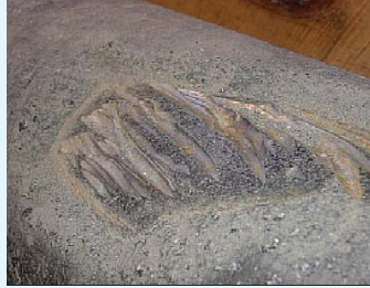
A gouged pipe. The coating has already been removed.

To report any incidents, such as gouges or dig-ins, on these underground facilities or others, immediately call LIPA Emergency Service at 1-800-490-0075.