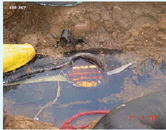
A dig-in of the pipe-type cable