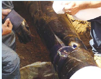
Insulating fluid that leaked prior to the repair required environmental clean up.